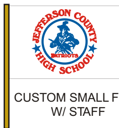
CUSTOM SMALL FLAG W/ STAFF