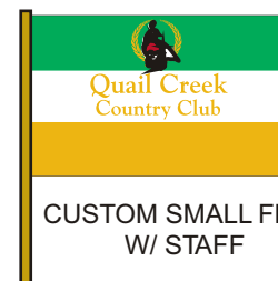
CUSTOM SMALL FLAG W/ STAFF