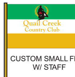
CUSTOM SMALL FLAG W/ STAFF